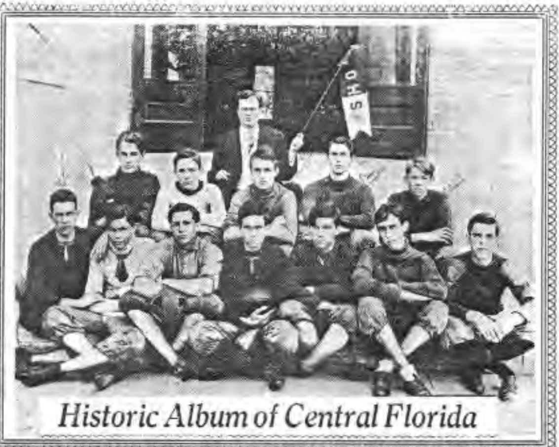
Historic Album of Central Florida

On December fourth, O. H. S. defeated the foot-ball team of Sanford High School, winning with a score of 14 to 0.