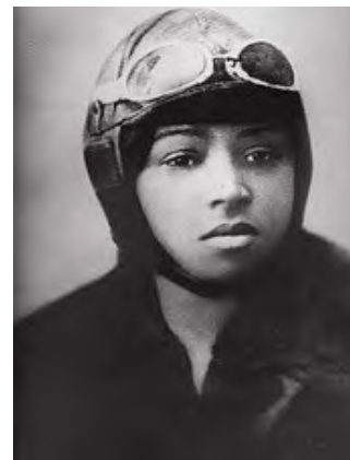
Bessie Coleman

With the patronage of a wealthy businessman, Bessie made the final payment on her plane in Dallas and arranged to have it flown to Jacksonville for her next engagement scheduled for May 1, 1926 to benefit the Negro Welfare League. On the evening of April 30 th , she and her mechanic took the plane up for a test flight. Once aloft, the plane malfunctioned and the mechanic, who was piloting the plane from the front seat, lost control of the plane.